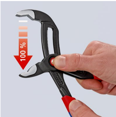
Press the button – open pliers completely