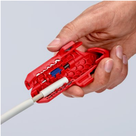
Stripping of a NYM cable