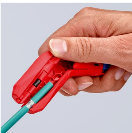
Stripping of a data cable