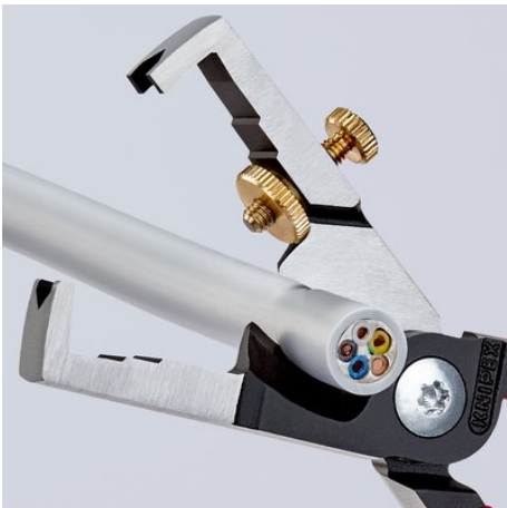
Induction-hardened shear blade with precisely ground cutting edges for crush-free cutting of copper and aluminium cables of up to \varnothing 15 mm (5 x 2.5 mm 2 )